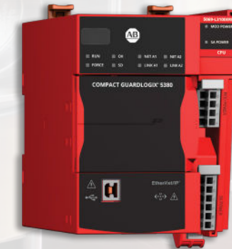
Compact GuardLogix 5380 SIL 2 controller