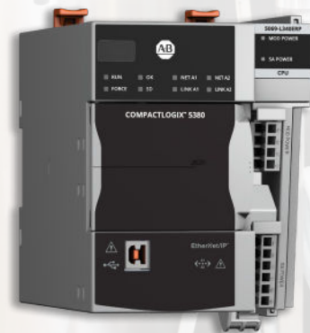
CompactLogix™ 5380 Process controller