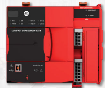
Compact GuardLogix® 5380 SIL 3 controller