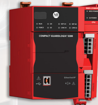
Compact GuardLogix 5380 SIL 2 controller