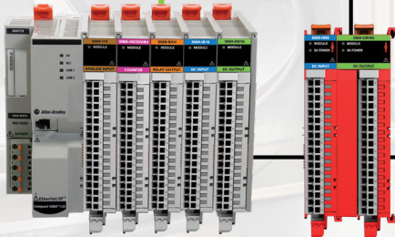
Compact 5000™ standard and safety I/O