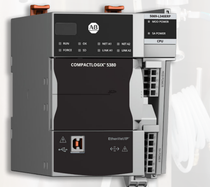
CompactLogix™ 5380 Process controller