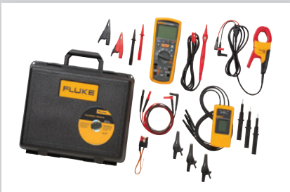
MDT Advanced Motor and Drive Troubleshooting Kit