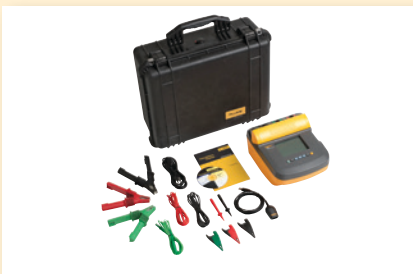
Fluke 1555 Insulation Resistance Tester Kit