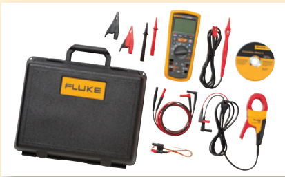
Fluke 1587 FC ET Advanced Electrical Troubleshooting Kit