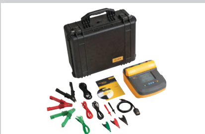
Fluke 1550C Insulation Resistance Tester Kit