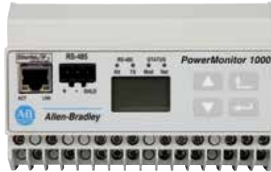
PowerMonitor 1000 EM3 and TS3A