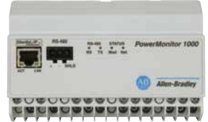
PowerMonitor 1000 BC3

Energy management and understanding energy costs are a major focus today in the industrial market. The Allen-Bradley® Bulletin 1408 PowerMonitor 1000 is a cost-effective energy monitor that is ideal for your applications where load profiling, cost allocation, or energy optimization is required. It also provides seamless integration to optimize your existing energy monitoring systems where sub-metering is required. The PowerMonitor 1000 is available in three models with features and a price point to meet your application.