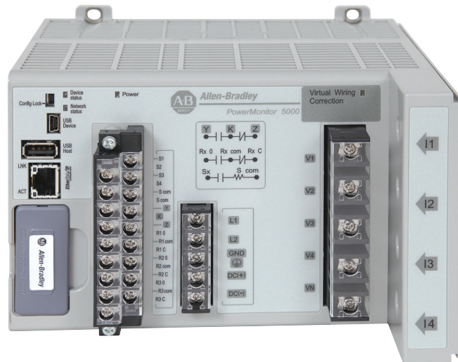
Allen-Bradley PowerMonitor 5000